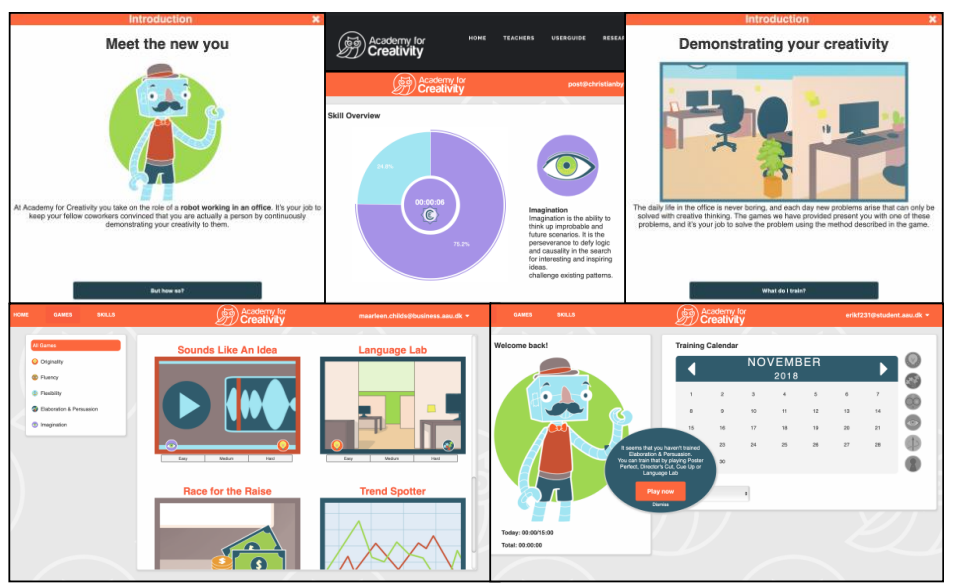
Illustration 2: Screen-dumps from the student profile at <u>www.academyforcreativity.com</u>.

This paper is available at: http://www.journalcbi.co m/embodied-gamifiedelearning-module-oncreativity.html