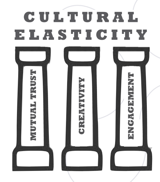
Figure 2: Cultural Elasticity Model

Leaders who wish to develop the engagement among the employees, should focus on creating meaningful understandings in the organisation. They should regard themselves as sense-makers in order to set direction and clear expectations in a meaningful way, thus providing the organisation with a clear 'why' - a purpose to set the direction for all the innovative projects and processes emerging in the organisation. As a result, leaders should also have great persuasive powers. Leaders supporting creative ideas without persuasive powers are often considered "crazy", "wild" or "irrational" when they attempt to make the organisation comply and follow these new ideas. Leaders should, therefore, be able to make convincing arguments for and orchestrated presentations of their new ideas - in particular when it comes to creating engagement for novel ideas.